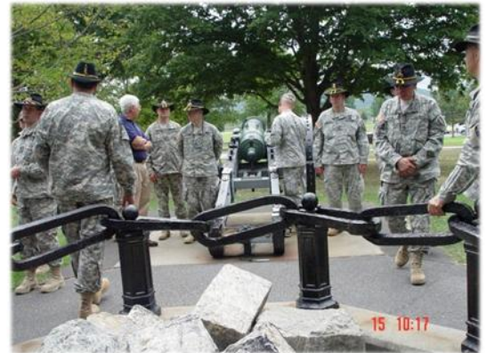
(Above - left) A replica of a Revolutionary War cannon used by the Colonials (Above - right) Some replica links of the chain that was used to prevent British warships from approaching West Point on the Hudson River)