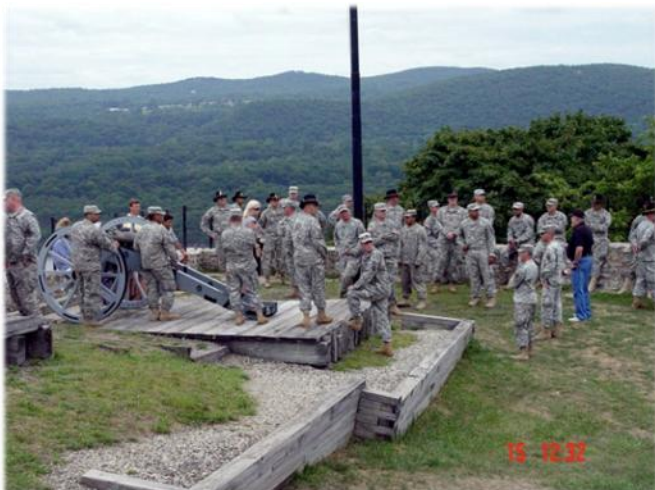
“Where’s the powder and shot?”