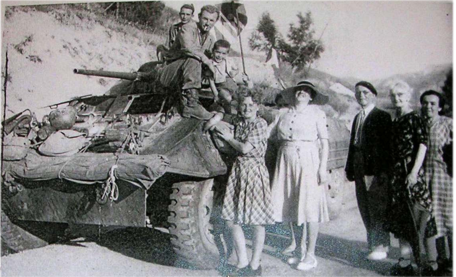
Briancon, France, near the Swiss border. Probably C Troop, 117 th Cavalry, 1 September 1944.